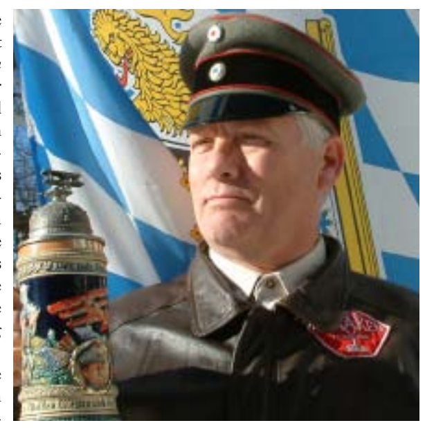
The current Morrisov recreates the scene at the Flitzer Werke.

The stein is now on display at the Connecticut Flitzer Werke in East Hampton, CT., which is resurrecting the Morrisov machine.