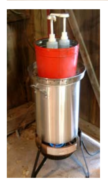
Keeping the glue warm...