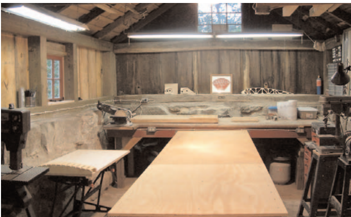
Inside the modernized and refurbished Connecticut Flitzer Werke.