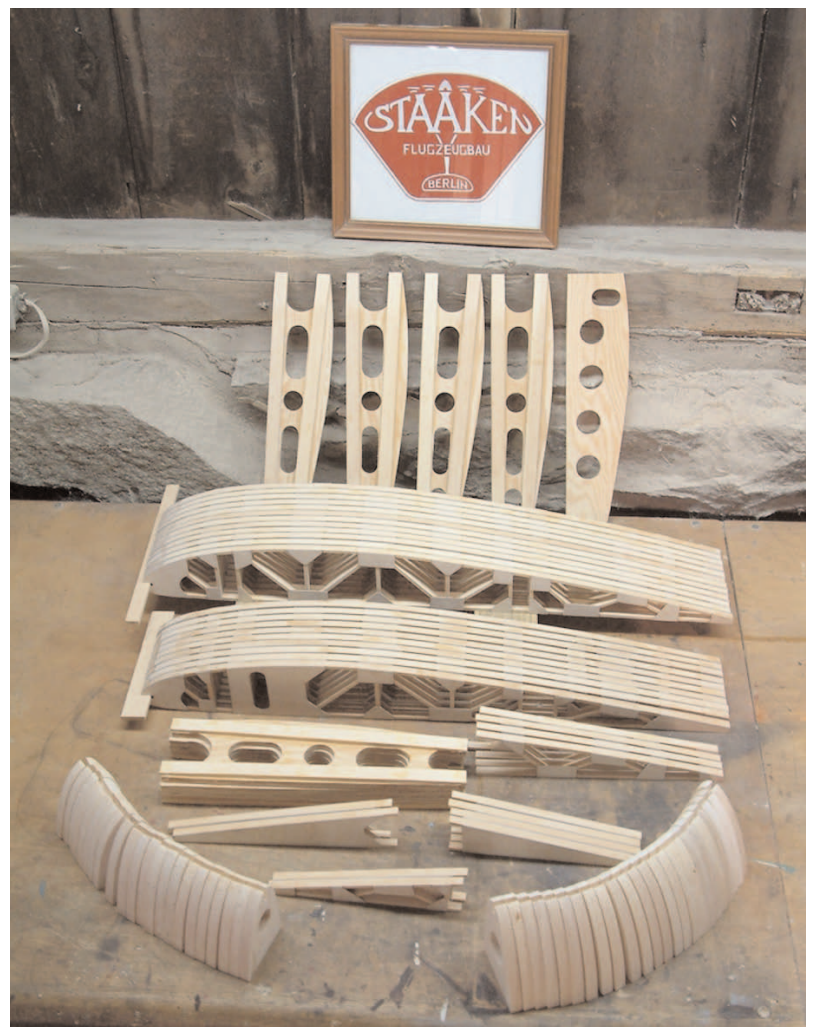
Just enough ribs for four wings and two ailerons.