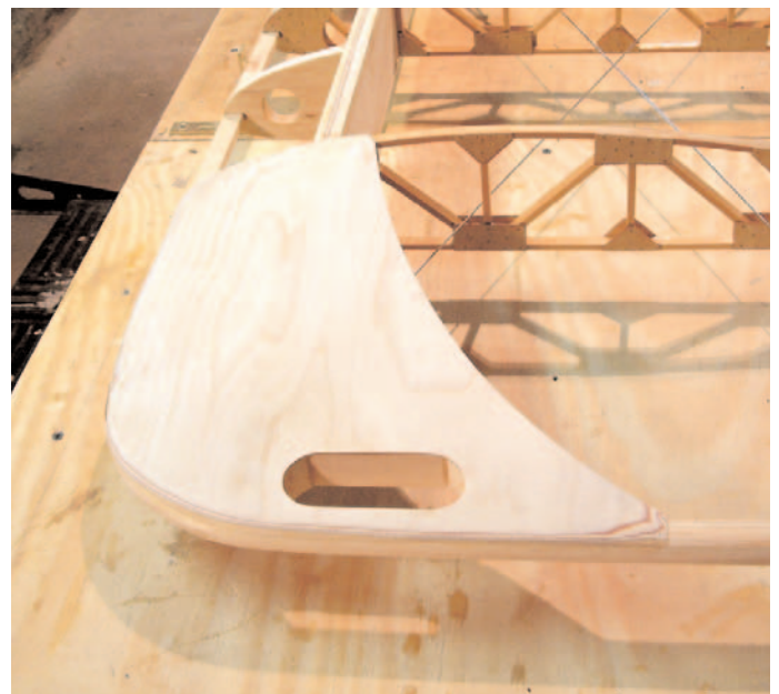
The lower wingtips each incorporate a handhold for ground handling.