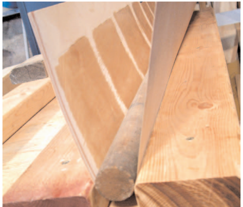
Leading edge plywood was pre-sealed, soaked and pre-bent in this simple tool.