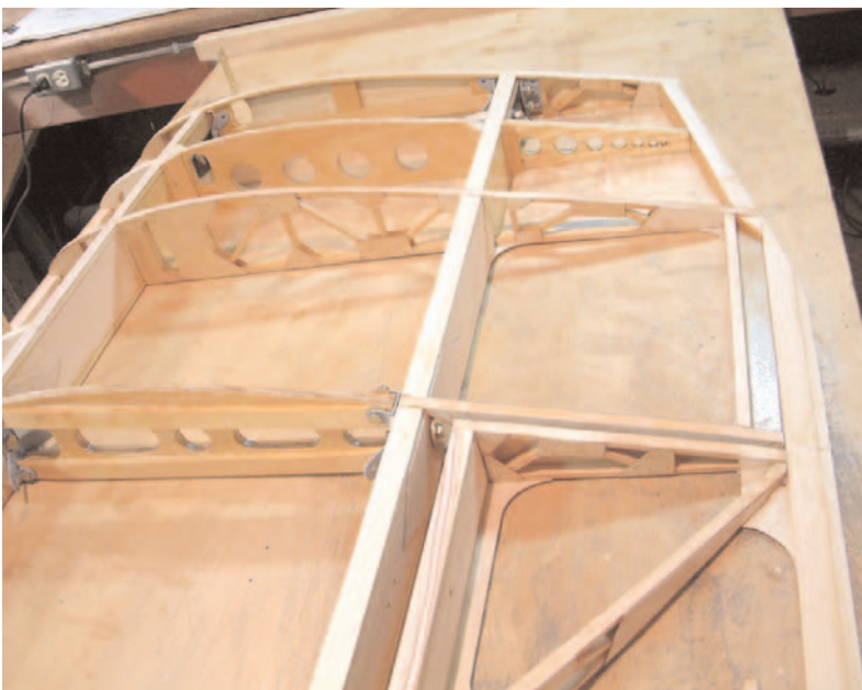
An extra, sturdy rib of plywood gives the strength needed for the wing walkway.