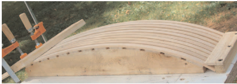
Capstrips for all the wing ribs were steamed and then bent in this simple jig.