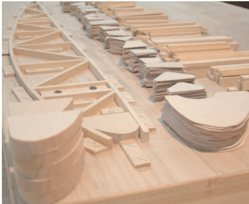
Wing ribs were glued, stapled in the jig, taken out and the other side done straight away.