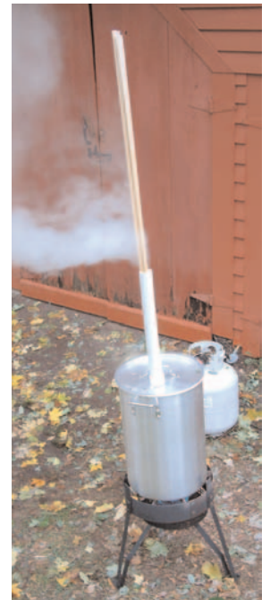
...and steamed wingtip bows.