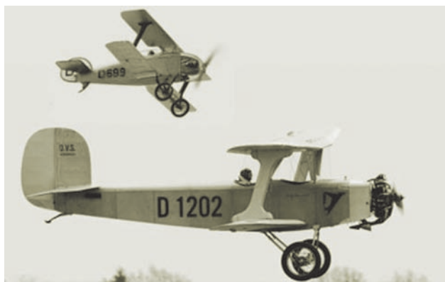
A rare shot of Flitzer D699 in formation with Udet U-12 D1202, perhaps at the Sportflug GmbH für Mittelfranken und Oberpfalz .