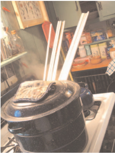
Steamed capstrips on the stove...