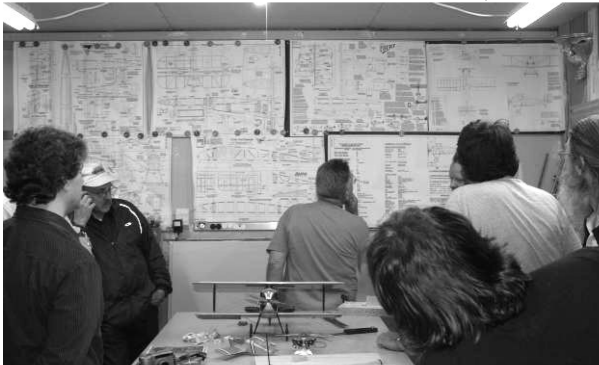
DRAWINGS WERE STUDIED ON THE BIG WALL OF PAPER. METAL STRIPS AND MAGNETS ARE HOLDING UP THE DRAWINGS OR THE PAPER IS HOLDING UP THE WALL, CAN'T REMEMBER!